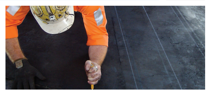
Our splice technicians are factory trained and MSHA certified.